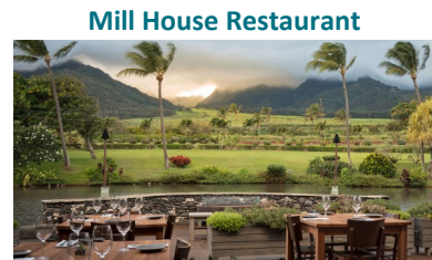
Mill House Restaurant