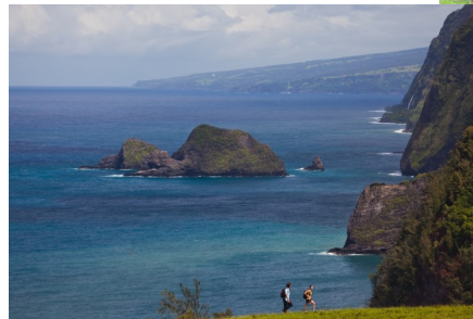
Pololū Valley, North Kohala