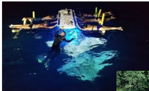
Night Manta Adventure